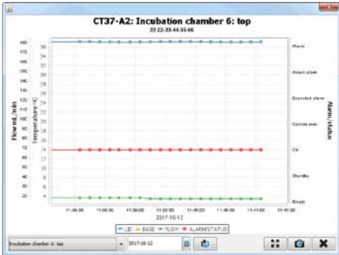
Real time graphical display of each incubator's performance