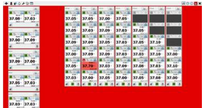
Display alerts and manage alarm notifications for any incubator connected to the system